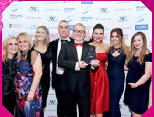
Restorative - Single Arch and Best Aesthetic Practice Riveredge Cosmetic Dentistry